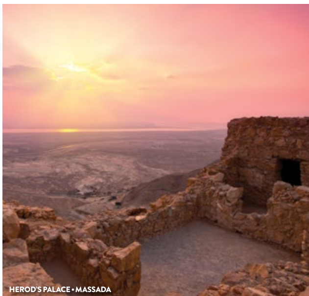
HEROD'S PALACE • MASSADA