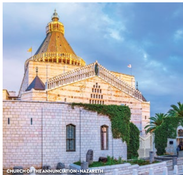
CHURCH OF THE ANNUNCIATION • NAZARETH

Drive via the Judean Hills to the Dead Sea and visit a Dead Sea cosmetics shop. Travel along the shores to Massada, then take a cable car to the top of Massada and visit Herod's palace. See the remains of the walls, synagogue, water cisterns, mosaic floors, Roman baths and other findings. Time and weather permitting, you'll have the opportunity to float in the Dead Sea and cover yourself with the mineral-rich mud that many believe has therapeutic effects.