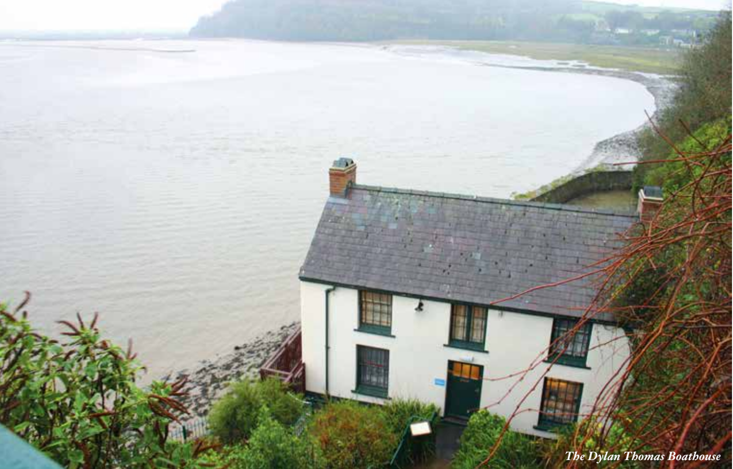
The Dylan Thomas Boathouse