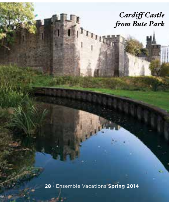
Cardiff Castle from Bute Park

Wales has a poetic tradition stretching back into the mists of time. For this is the land of the true Britons - where the British